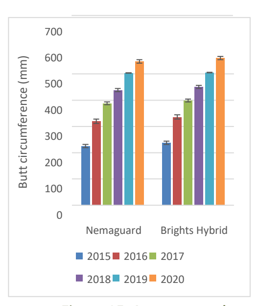
Figure 35. Average trunk circumference.

Brights Hybrid showed a steady increase in average seasonal yield over time unlike many other rootstocks where the average annual yield in 2020 and / or 2021 declined below 2019 levels.