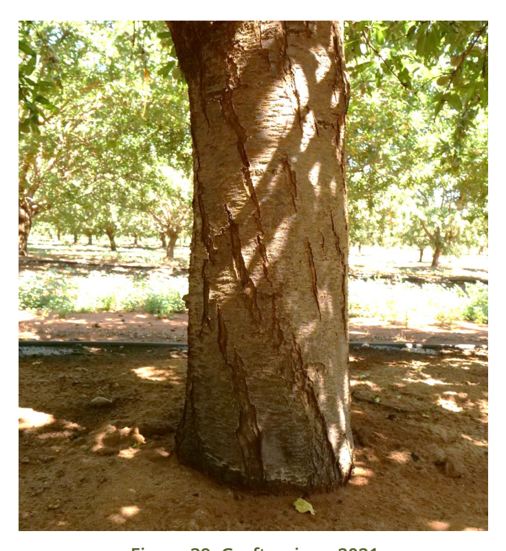
Figure 39. Graft union - 2021.