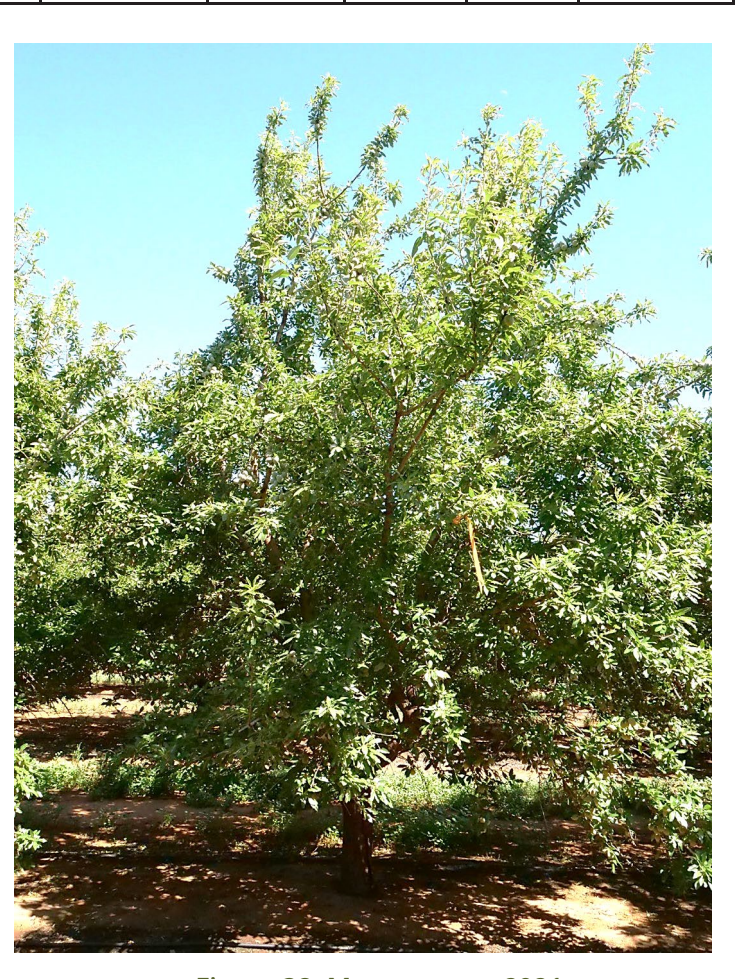
Figure 38. Mature tree - 2021.