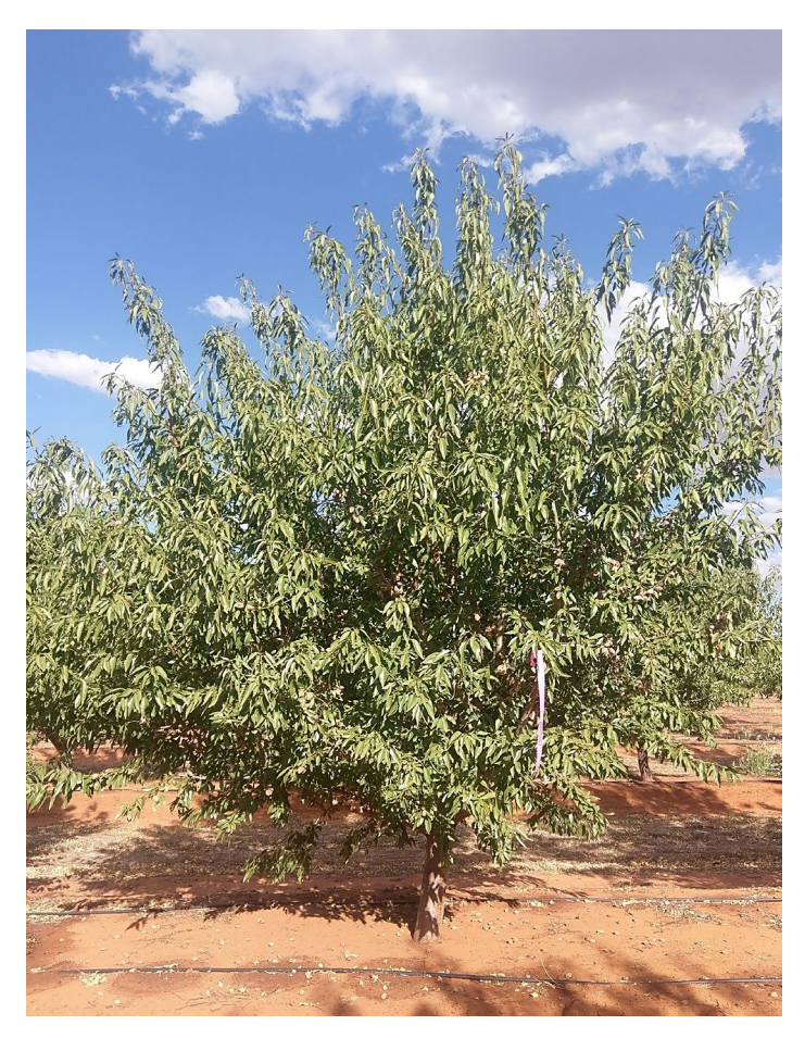
Figure 37. Juvenile tree - 2017.