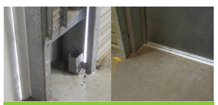
Figure 8: Small holes (>6mm) allow entry into facilities. This is especially important round roller doors where it is difficult to reduce gaps. (a) Small gap alongside roller doo allowing entry. (b) Well fitting metal door strips improve management of entry of mice.