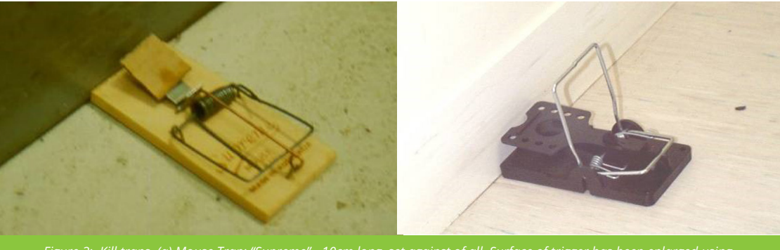
Figure 3: Kill traps. (a) Mouse Trap: "Supreme" - 10cm long, set against of all. Surface of trigger has been enlarged using leather soaked in linseed oil. (b) Strong plastic moulded rat trap - 14cm long. **NB** Photos not to scale