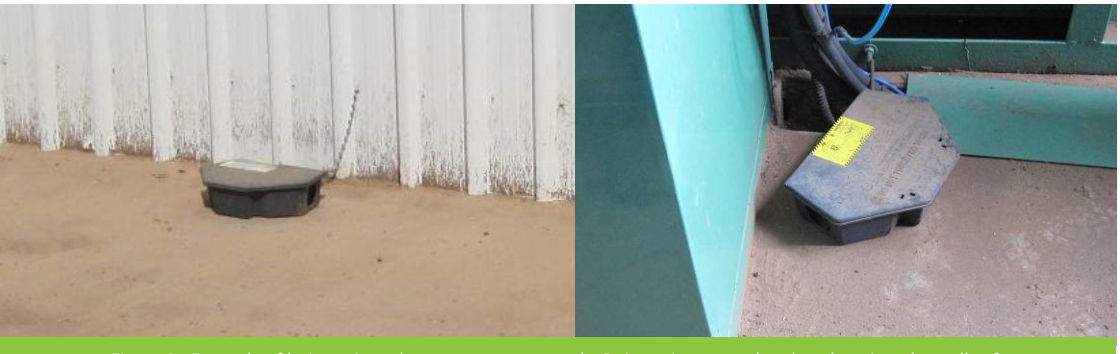
2: Example of bait stations that are not set properly. Bait stations must be placed against the walls of structures to increase the chance of rats or mice entering and consuming the bait