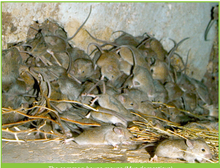
ne common house mouse (Mus domesticus)

Mouse populations have an ability to increase rapidly in size in a very short period. Theoretically, one breeding pair of mice can produce 500 mice within 21 weeks.